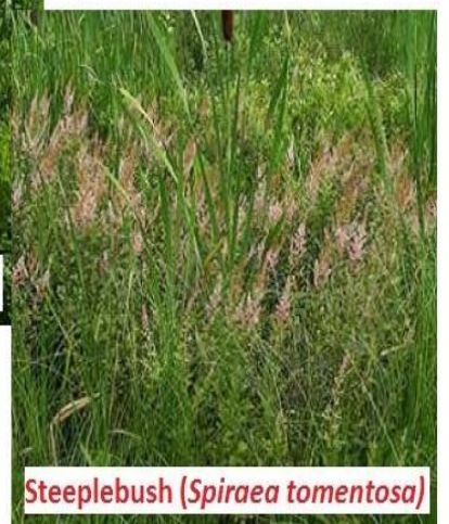
Steeplebush ( Spiraea tomentosa )

They are also an important erosion control shrub at the land/water interface on banks where each reduces the energy of splashing wave action and ice push.