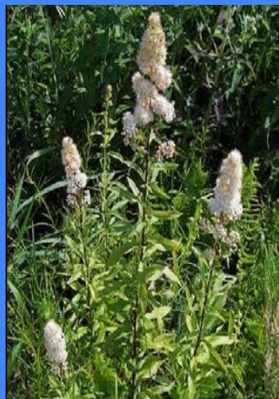
Meadowsweet ( Spiraea alba )

Start with these shrubs and add colorful native flowers for an attractive and enduring natural barrier to our friends from Canada.